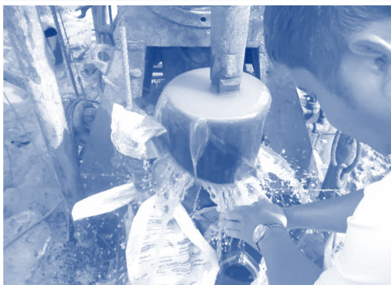
Deep Well drilling at Brgy. Tidman, Hinatuan Surigao del Sur by Hanna Via Construction Inc.